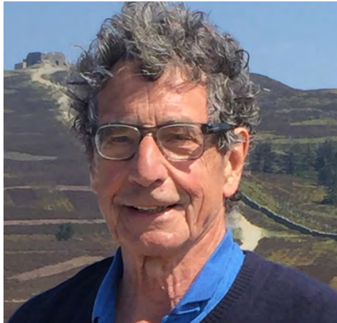
TONY BURTON OBE